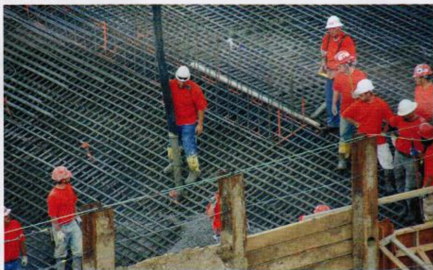
Below: F.A. Wilhelm Construction Co. crew places concrete for JW Marriott Indianapolis foundation.