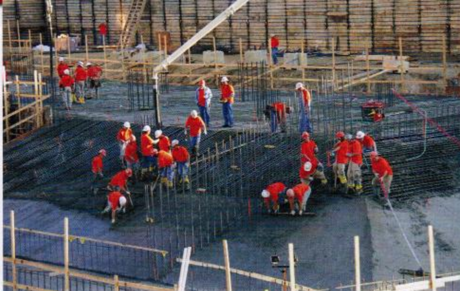
Above: The big pour on Oct. 10-11 involved the continuous placement of more than 5,800 cubic yards of concrete.

Brown says IMI loaded its trucks out of “two primary plants in the evening, using one as a backup. Then, in the morning we began running three primary plants and one backup.” ■